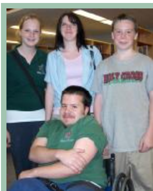
... I enjoy being in class with my friends