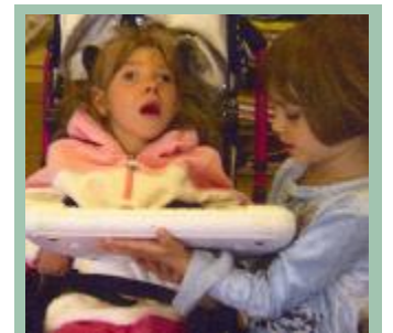
My friends listen to music and sing to me

North Cavan Public School is a superb model of inclusion in action. This is due in large part to its proactive and dedicated Principal, Beverley Care, who advocates for all her students to ensure their respective needs are addressed.