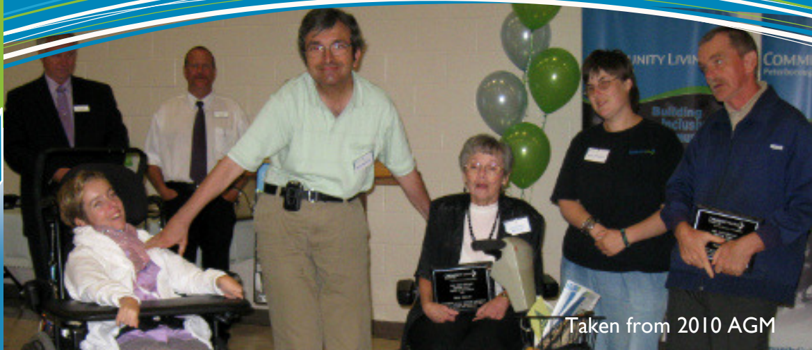
Taken from 2010 AGM